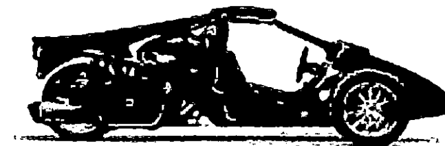
The Campagna T-Rex