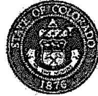
John W. Hickenlooper Governor

136 State Capitol Denver, Colorado 80203 Phone (303) 866-2471 Fax (303) 866-2003